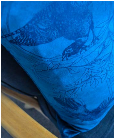
Image: Amazing Jumbo Printed Cordoruy Fabric available by the meter