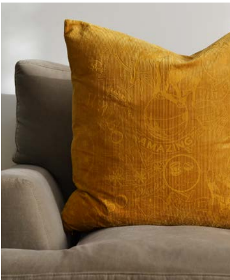
Image: Amazing Jumbo 60cm by 60cm Cushion in Mustard