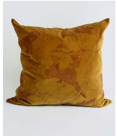
Image: Printed Cordoruy Cushions 60cm by 60cm