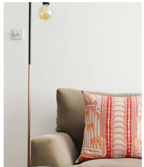
Image: Western Avenue 100% Linen and Cordoruy Cushion, 45cm by 45cm in Coral