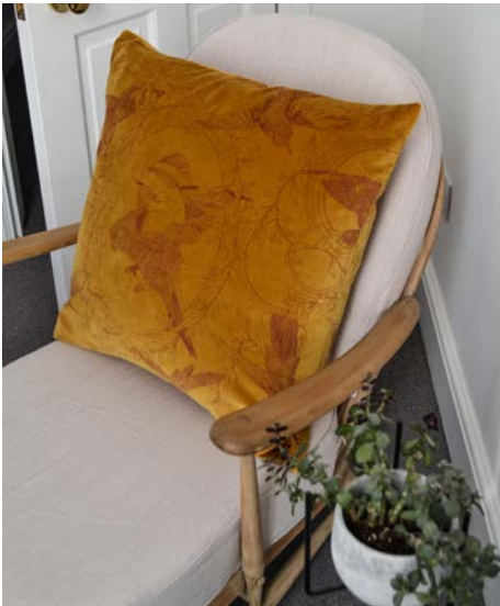
Image: Amazing Jumbo 60cm by 60cm Cushion in Mustard

A brand new addition to the textile collection is a vibrant and sumptuous 100% cotton velvet fabric. Printed with Taxidermy Bird's, a popular wallpaper design, where on further inspection the seemingly beautiful birds are in fact pinned, stuffed and preserved in static macabre. The new collection comprises of a beautiful large cushion in the velvet fabric available in a plush Gold, Emerald and Petrol.