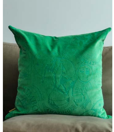
Image: Amazing Jumbo Printed Cordoruy Cushion 60cm by 60cm in Mint