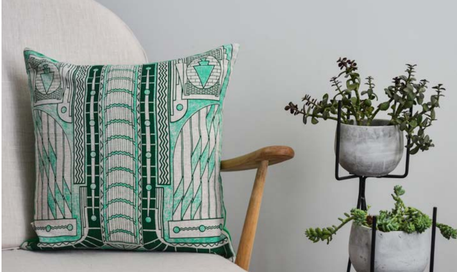
Image: Western Avenue 100% Linen and Cordoruy Cushion, 45cm by 45cm in Mint.