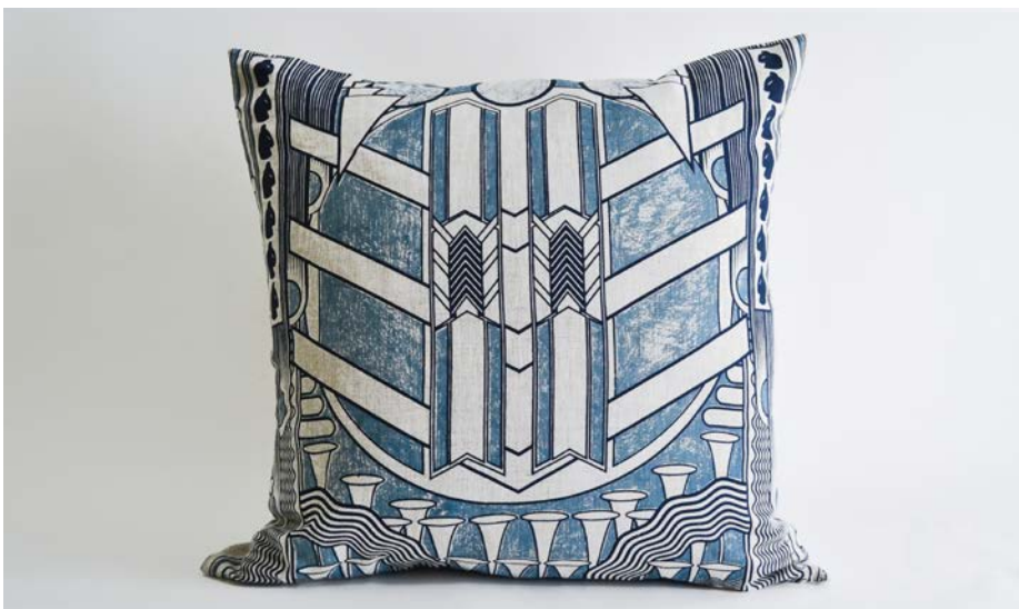
Image: Wallace 100% Linen Cushion, 60cm by 60cm in Navy Blue and Colbalt

From fresh mint to vibrant turquoise, green is a feature colour in this season's collection. Graphic combinations are in abundance as Daniel's Western Avenue cushion, in a new dual green colour combination, is silk-screen printed onto 100% Linen. For a pure green injection for any interior, Amazing Jumbo is a slouchy feather filled large cushion, that combines colour impact with high craft aesthetics.