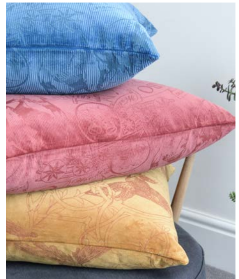
Image: Printed Cordoruy Cushions 60cm by 60cm